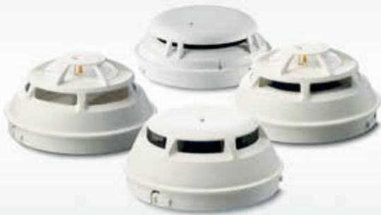
Data centers, telecommunications facilities, office buildings, or industrial production facilities – Cerberus PRO offers a detector for any application.

A comprehensive offering of standard detectors and advanced detectors with ASAtechnology ™ offer versatility to protect clean, dirty, or normal environments.